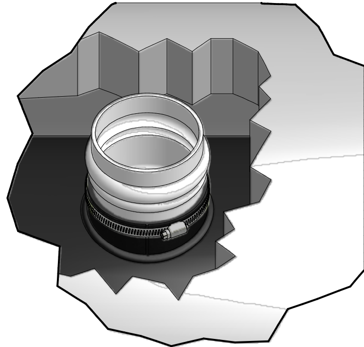
DETAIL B SCALE 1/4